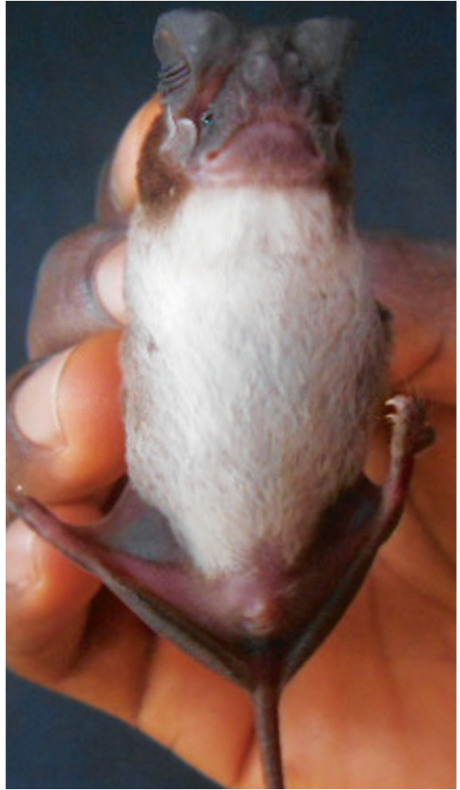
FIG. 17. — Mops (Xiphonycteris) nanulus J. A. Allen, 1917.

HABITATS AND DISTRIBUTION. — The Dwarf free-tailed bat is widely, but patchily, recorded in West, Central and East Africa from Sierra Leone and Guinea through Cameroon, to western Ethiopia and southward to Democratic Republic of the Congo (Happold 2013h