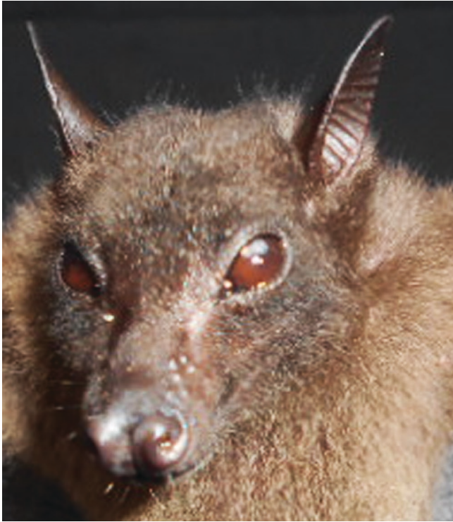
FIG. 7. — Myonycteris angolensis (Bocage, 1898).