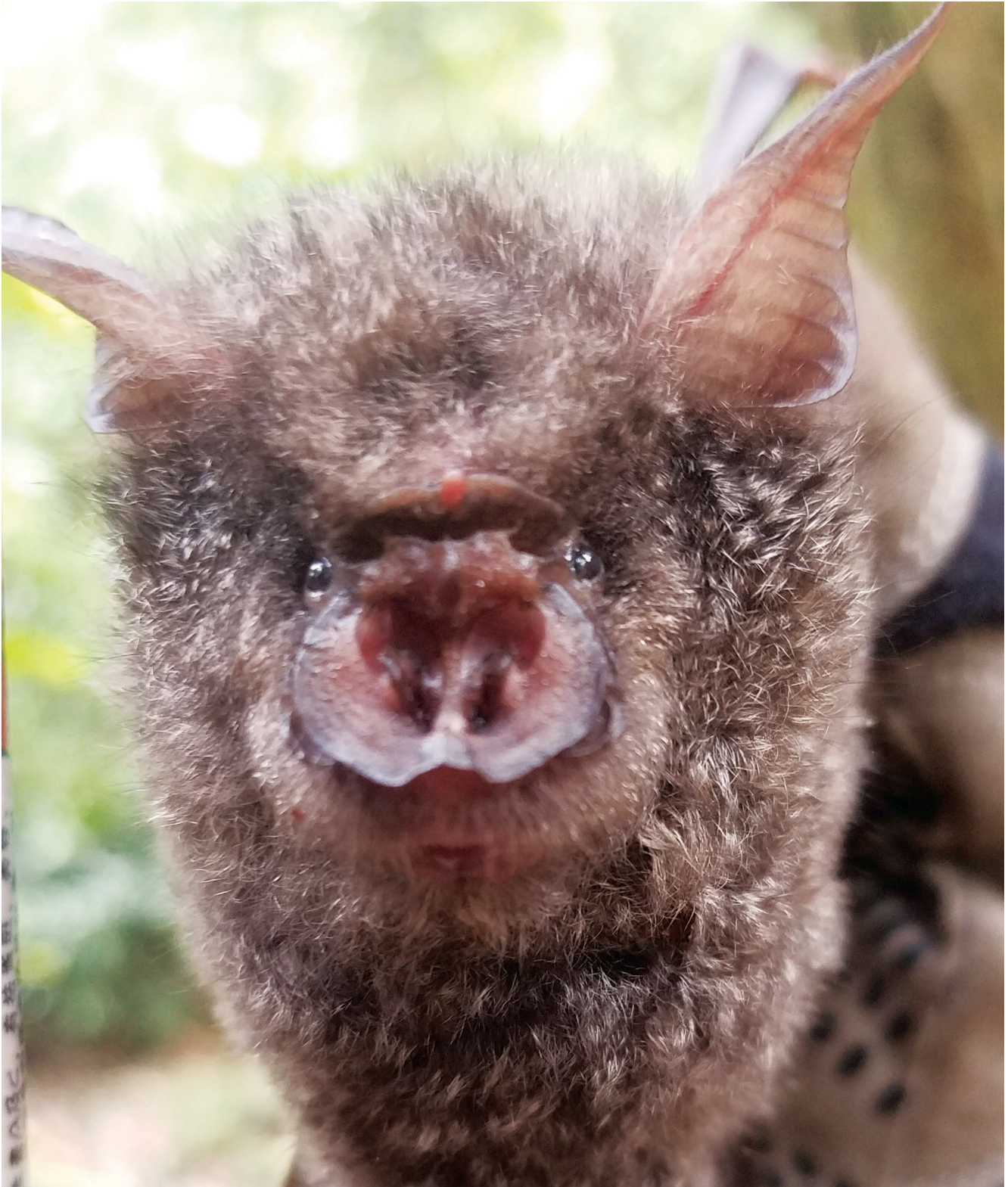
FIG. 13. — Doryrhina cyclops (Temminck, 1853).

Martin Eisentraut leg.; SMNS 5199 to 5206, 6593 to 6595, ZFMK 1961.0650 • 3 specimens; Koto - Barombi; 4°27'57"N; 9°16'01"E; 457 m; 16.I.1958; Martin Eisentraut leg.; ZFMK 1961.0651, ZFMK 1963.0448, 0449 • 1 specimen; Musake; 4°12'00"N, 9°12'00"E;