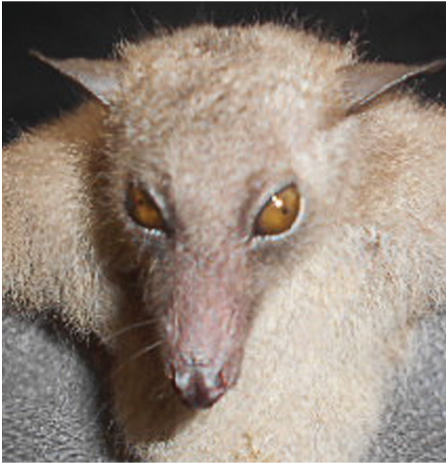
FIG. 5. — Megaloglossus woermanni Pagenstecher, 1885.

11°2'47"N, 14°8'26"E; Martin Eisentraut leg.; ZFMK 1973.0370 • 11 specimens; Bipindi; 3°05'00"N, 10°25'00"E; 184 m; Zenker Georg August leg.; ZMB 1128, 11280, 40160, 40161, 4785, 54934, 67098, 67101 to 67103, 67105 • 3 specimens; Yaoundé; 3°52'00"N, 11°31'00"E; 726 m; Carnap-querheimb & Heberer leg.; ZMB 10026, 10029, 54520 • 2 specimens; Moungo River; 4°02'50"N, 9°33'41"E; Buchholz leg.; ZMB 5001, 5002 • 1 ♂; Longji; 3°04'31"N, 9°58'40"E; 15 m; Paschen leg.; ZMB 54933 • 1 ♀; Batonga; 4°01'49"N, 9°06'04"E; 79 m; Kaiser leg.; ZMB 67103 • 3 ♂; Kribi; 2°57'00"N, 9°55'00"E; 13 m; Zenker Georg August leg.; ZMB 9041, 9972, 9973.