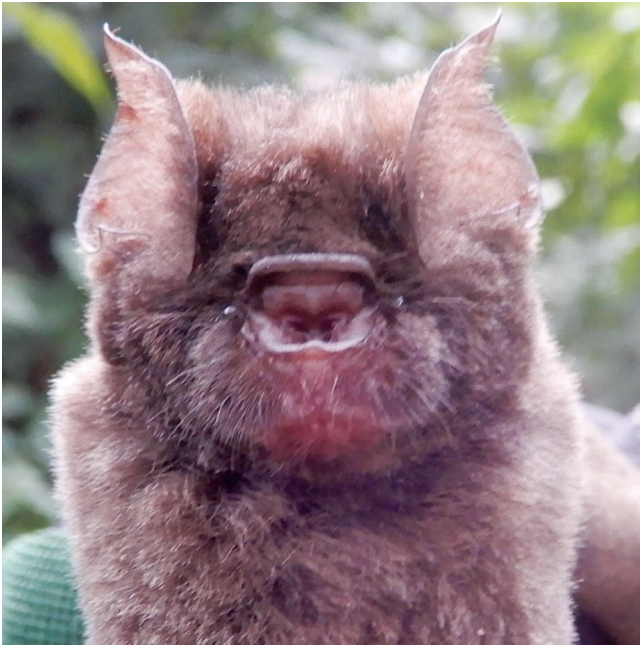
FIG. 14. — Hipposideros cf. ruber (Noack, 1893). Photo: © Aaron Manga Mongombe.

9°17'08"E; 151 m; 8.III.1938; Martin Eisentraut leg.; SMNS 5600a • 7 specimens; Mukonje; 4°35'02"N, 9°30'18"E; 113 m; 16.II.1938; Martin Eisentraut leg.; ZMB 67673 to 67678, ZMB 93813.