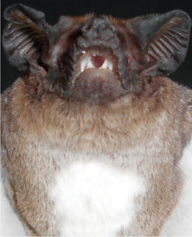
FIG. 16. — Chaerephon major (Trouessart, 1897).