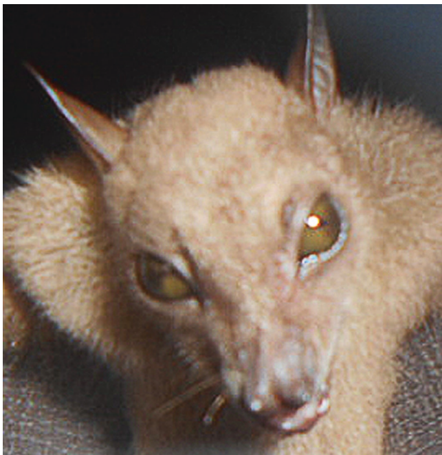
FIG. 8. — Myonycteris torquata (Dobson, 1878).

Africa, it was captured both inside and outside forested habitats from 500 m to 1350 m a.s.l. (Monadjem et al. 2016). Thomas & Henry (2013) also noted that this species prefers secondary to primary forest and is often caught in gardens, and in clearings close to dense undergrowth. They roost singly or in pairs in lower part of trees among dense foliage within few meters of the ground (Happold 1987).