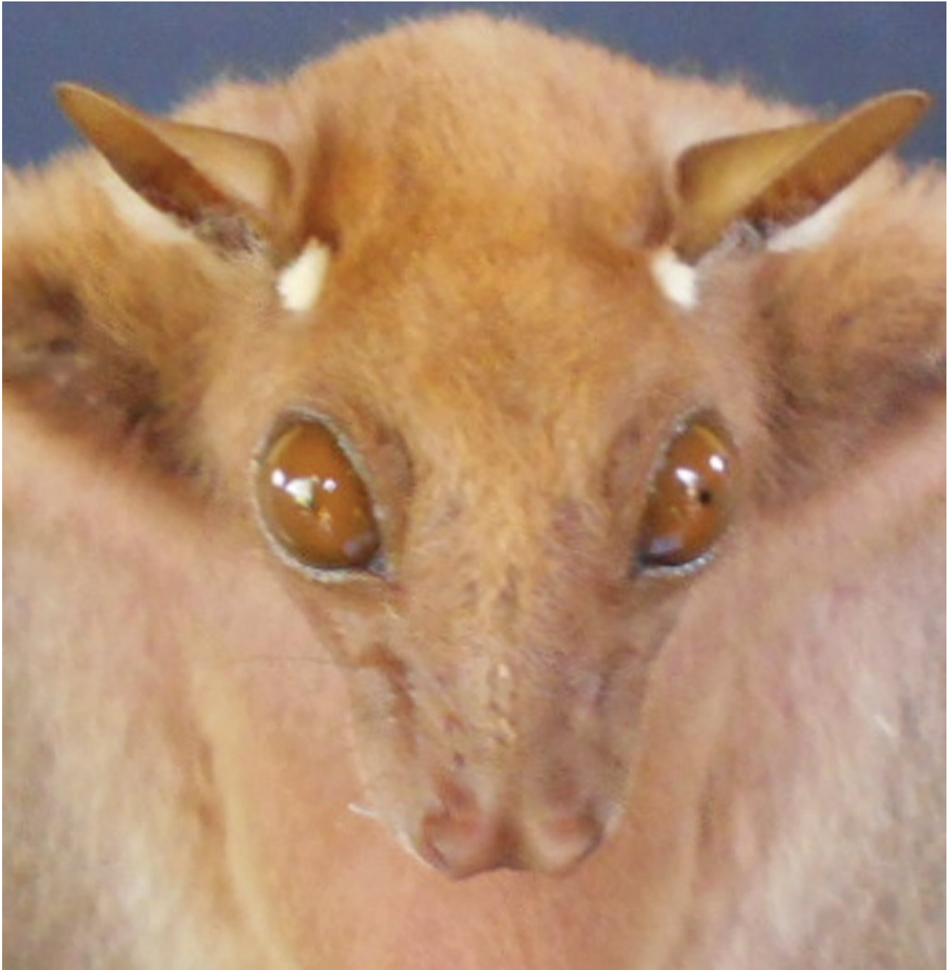
Fig. 6. — Micropteropus pusillus (Peters, 1868).

Mount Cameroon area • 1 specimen; Isobi; 4°07'15"N, 8°59'33"E; 56 m; 20.II.1958; Martin Eisentraut leg.; ZFMK 1961.0625 • 1 specimen; Buea; 4°09'00"N, 9°12'00"E; 1050 m; 16.II.1967; Martin Eisentraut leg.; ZFMK 1969.0599 • 11 specimens; Victoria; 4°00'46"N, 9°13'13"E; 136 m; 20.XII.1968-28.II.1973; Martin Eisentraut leg.; ZFMK 1969.0587 to 0589, 0788a, 0788b; ZFMK 1972.0056, 0058a, 0058b, 1973.0374, 0375, 0377.