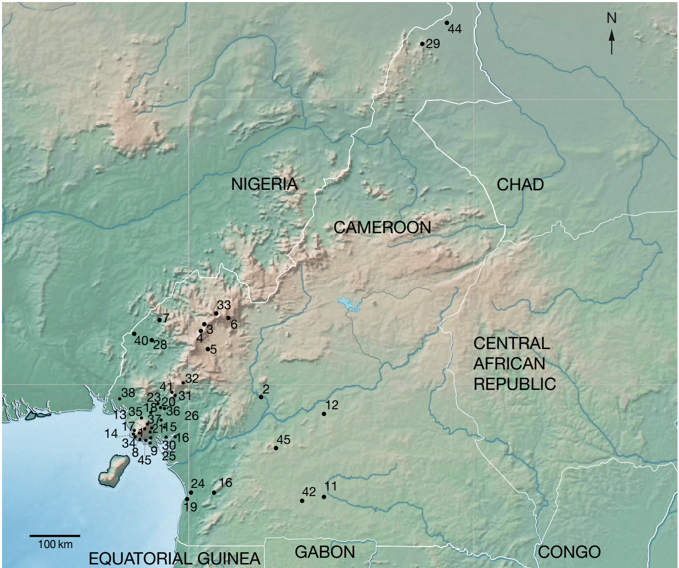
Fig. 1. — Map of Cameroon, showing localities listed in the text (See Appendix 1 for names of localities).

W. Verheyen, Hulselmans, Colyn & Hutterer, 1997); another near-endemic is the Cameroon Praomys ( Praomys morio (Trouessart, 1881), (Fotso et al. 2001). Most of these species are listed by the IUCN Red List as vulnerable or critically endangered: a concerted effort to protect them is thus highly necessary.