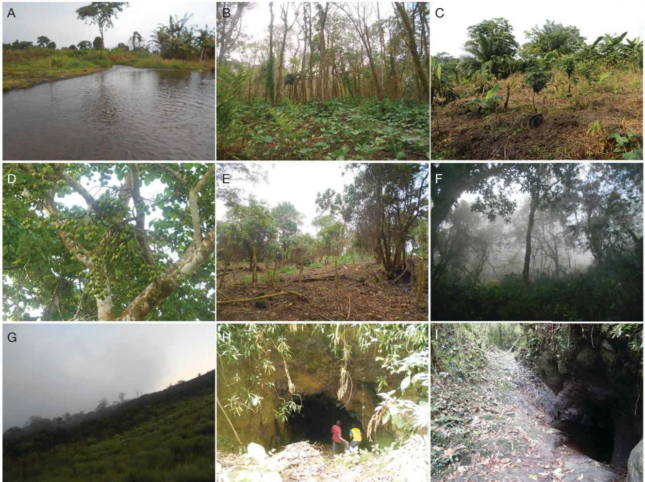
FIG. 2. — Habitat sampled for bats on Mount Cameroon: A , slow flowing streams; B , cultivated farmland; C , fallow farmland; D , beside fruiting trees; E , cleared farmland; F , understory of primary forest; G , ecotone forest/ alpine grassland; H , cave; I , waterhole.

Nanonycteris veldkampii (Jentink, 1888) were only captured in disturbed low altitude habitats. Meanwhile Rousettus aegyptiacus was the only species that was recorded primarily in undisturbed high altitude primary forest (Table 1).