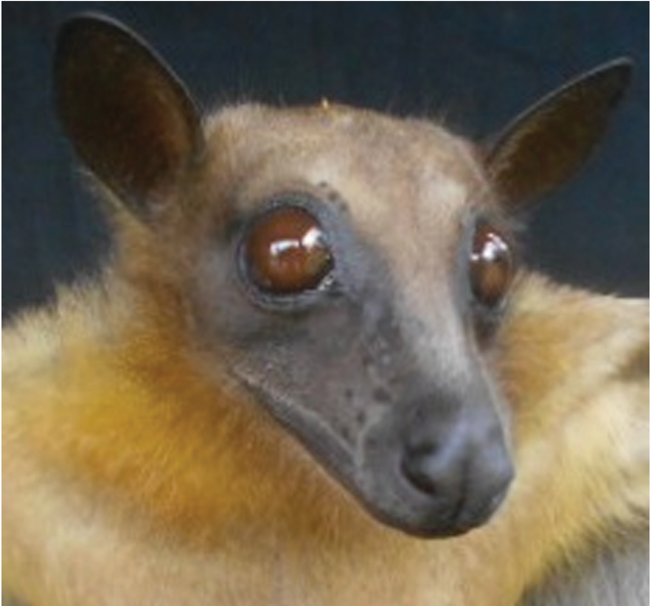
FIG. 3. — Eidolon helvum (Kerr, 1792).

All individuals were captured at altitudes below 1140 m a.s.l. in disturbed and cultivated lowland rainforest and montane forest habitats (Table 1). This species was also collected by Eisentraut (1964) and Fedden & MacLeod (1986), in disturbed and cultivated habitats on Mount Cameroon. This species has also been recorded in the Sahelian zone of northern Cameroon (Bakwo Fils et al. 2014), and the tropical humid forest of Southern Cameroon (Bakwo Fils 2009).