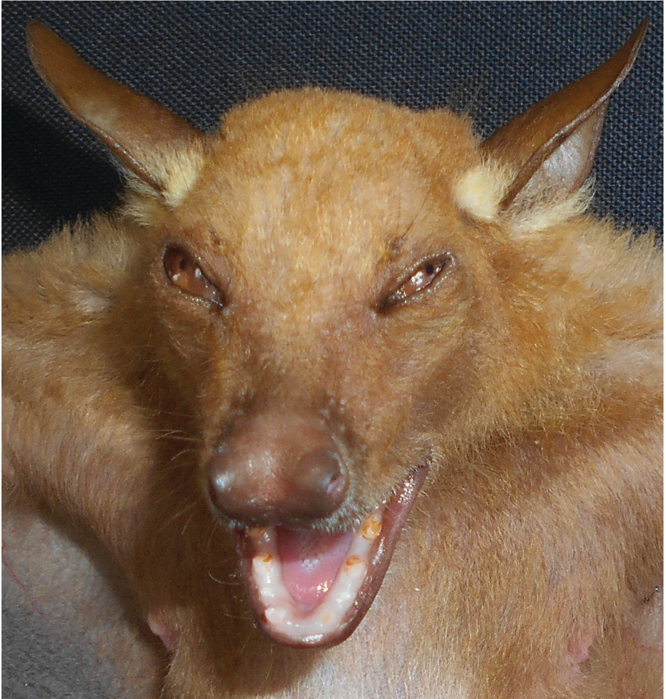
Fig. 4. — Epomops franqueti (Tomes, 1860).

9°13'13"E; 136 m; 13.XII-16.XII.1966 & 11.XI.1973; Martin Eisentraut & Preuss P. leg.; ZFMK 1969.0579 to 0586; 1973.0371 to 0373, 0382, 0383, ZMB 53871, 53872, 53916, 67052, 9040 • 16 specimens; Mueli; 4°23'00"N, 9°07'00"E; 600 m; 20.I-9.II.1958; Martin Eisentraut leg.; ZFMK 1961.0604, 0605, 0609, 0611 to 0615, 0619, SMNS 6635 to 6641 • 5 specimens; Koto-Barombi; 4°27'57"N, 9°16'01"E; 457 m; 16.I-21.I.1958; Martin Eisentraut leg.; ZFMK 1961.0616, 0617, 0620, SMNS 6633, 6634 • 14 specimens; Isobi; 4°07'15"N, 8°59'33"E; 56 m; 17.I.1958; Martin Eisentraut leg.; ZFMK 1961.0606, 0608, 0610, 0618; 1969.0420, SMNS 6642 to 6650 • 1 ♂; Buea; 4°09'00"N, 9°12'00"E; 1050 m; 17.I.1958;