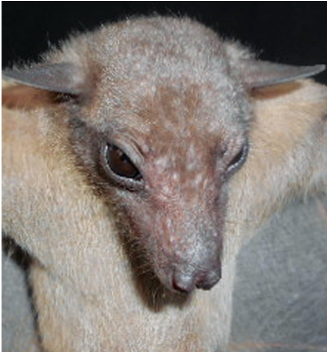
FIG. 10. — Roussettus aegyptiacus (E. Geoffroy St.-Hilaire, 1810).