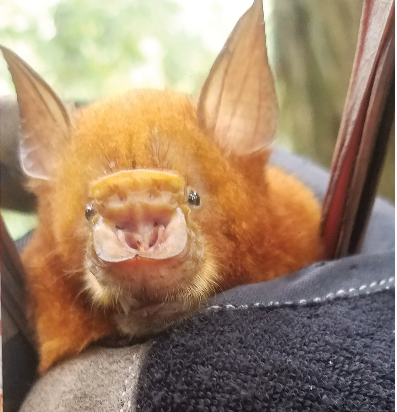
FIG. 15. — Macronycteris gigas (Wagner, 1845).

HABITAT AND DISTRIBUTION. — This species is widely distributed over much of West and Central Africa from Sierra Leone in the West, through the Congo Basin to East Africa and the Democratic Republic of the Congo. Nycteris arge is predominantly a lowland rainforest inhabitant, although in southern Africa it can be encountered in forest edges (Monadjem et al. 2010). It roosts singly or in small groups in hollow cavities of trees with large trunks, especially trees with opening near the ground (Happold 1987). According to Rosevear (1965), this species forages in forest clearing and may enter houses to hunt insects attracted to strong light. This species has been listed to occur on Mount Cameroon (Van Cakenbergh & De Vree 1985).