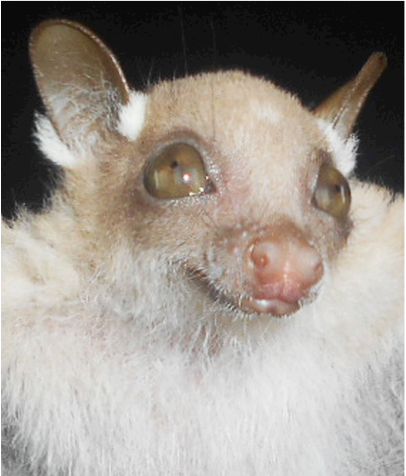
FIG. 9. — Nanonycteris veldkampii (Jentink, 1888).

MATERIAL EXAMINED. — 14 specimens (including original data). Mount Cameroon area • 2 specimens; Mueli; 4°23'00"N, 9°07'00"E; 600 m; 16.II.1958; Eisentraut m leg.; ZFMK 1961.0646, 0647 • 2 specimens; Malende Swamp Area; 4°21'00"N, 9°26'00"E; 50 m; 19.XII.1957; Martin Eisentraut leg.; SMNS 6624, 6625.