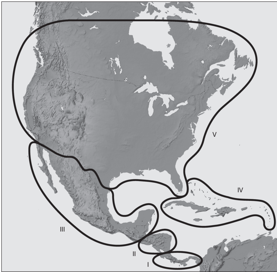
FIG. 3. — Map of the study area showing the phases (I-IV) of the dynastine biotic inventory project.

species have also been described since 1985, and so the keys in Endrödi's manual are not totally accurate. For example, 90 species of Cyclocephala have been described since the manual was published, and so the keys in it should be used with great caution because there now exists 43% more species than were included in the keys published in 1985!