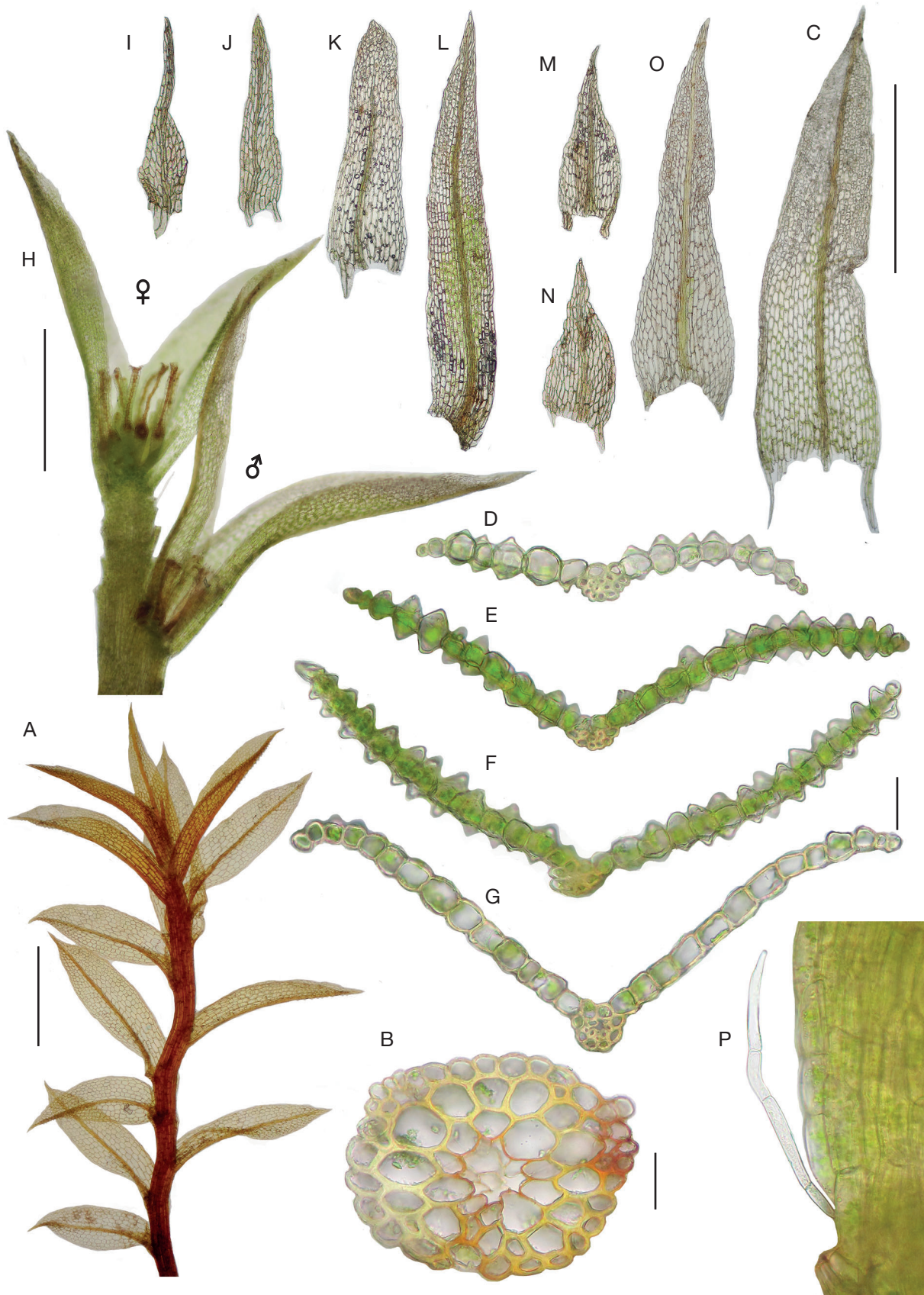
FIG. 2. – Koponobryum papillosum Printarakul & Chantanaorr., sp. nov.: A , KOH color reaction of plant; B , cross section of stem; C , vegetative leaf; D-G , cross sections of leaf from upper to base; H , perichaetium and perigonium; I-L , perichaetial leaves; M-O , perigonial leaves; P , axillary hair. All from N. Printarakul & K. Adulkittichai 19072020_1 (CMUB). Scale bars: A, 1 mm; B, D-G, P, 25 \mu m; C, H-O, 0.5 mm.